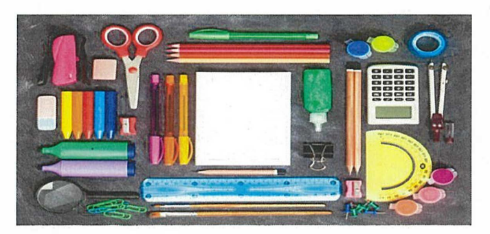
Quality teaching to maximise student learning

Please ensure all equipment is opened and labelled on the product and in the pencil case.