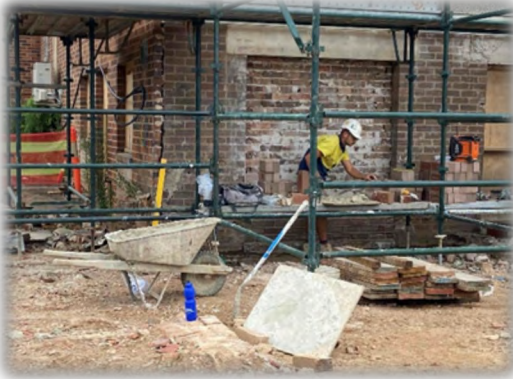
Bricking up the interface with A Block