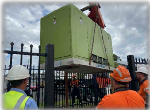
The new substation arrives!