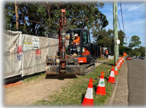
More Fullagar Road action!