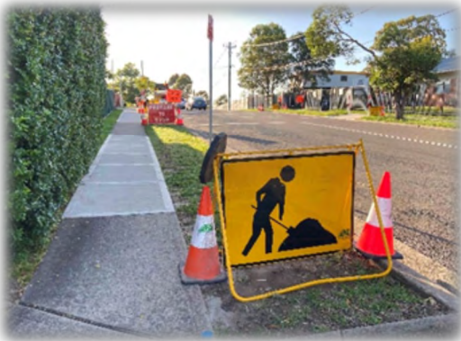
Lots happening on Fullagar Road!