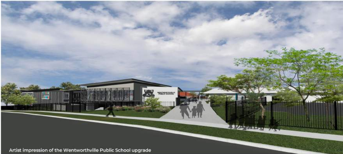
Artist impression of the Wentworthville Public School upgrade